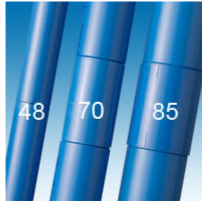
Incliner Casing is available in three standard sizes... 1-15/16-inch (48mm), 2-3/4-inch (70mm), 3-3/4-inch (95.2mm) Outside Diameter