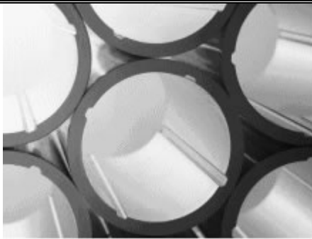
Q-Series Incliner Casing