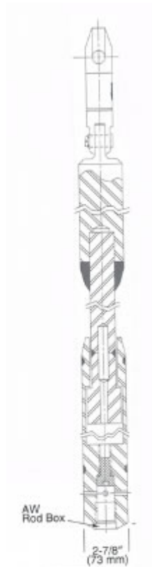
140-Pound (63.5 kg) In-Hole Hammer Assembly with Swivel & AW Box Down